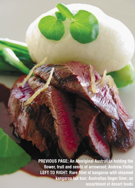
PREVIOUS PAGE: An Aboriginal Australian holding the flower, fruit and seeds of arrowroot; Andrew Fielke LEFT TO RIGHT: Rare fillet of kangaroo with steamed kangaroo tail bun; Australian finger lime; an assortment of desert foods